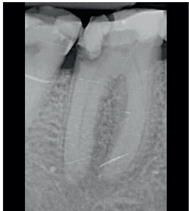
Fig. 1: Pre-operative X ray of tooth #36 on a 47 years old man.